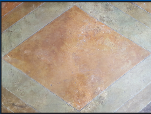
ACID STAINED 200 Sq.Ft/Gallon