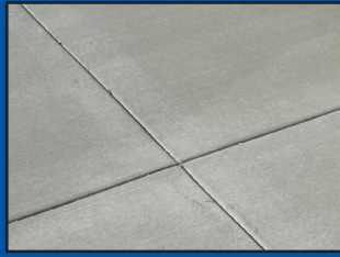
BROOMED 200 Sq.Ft/Gallon