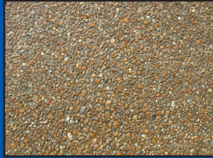
AGGREGATE 100 Sq.Ft/Gallon