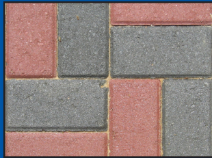
PAVERS 75 Sq.Ft/Gallon

DO NOT USE ON: Clay bricks, Slate, Stone Slabs, Granite, Travertine, Glazed Tile, Terrazzo, Epoxy Set Stone, Chattahoochee, Polished Densified, Painted Surfaces, Surfaces Previously Coated with Water Based Stains, Colored Sealers, or over Recently Treated Curing Compounds. Not for Vertical Surfaces except Steps. Not recommended on Surfaces Not Specifically Recommended. Always test before proceeding. VENTILATE WELL, EXTINGUISH OPEN FLAMES. EXTERIOR USE ONLY