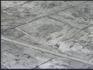
STAMPED 200 Sq.Ft/Gallon